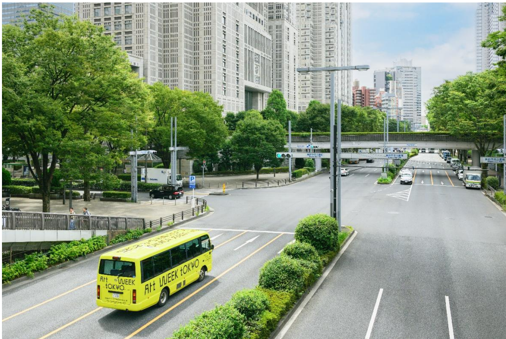
The AWT Bus, 2025.

Art Week Tokyo—an annual, five-day, citywide celebration of the creativity and diversity of art throughout the Japanese capital—returns for its 5th edition from November 4–8, 2026. Bringing together a record 55 participating venues across the city for five days of coordinated programming and special platforms, it also welcomes first-time participants including Shibunkaku (AWT Focus), Pola Museum Annex (Institutions), Ceysson & Bénétière (Galleries), and Parcel (Galleries).